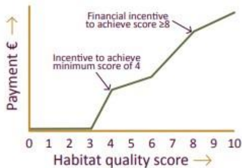
Figure 1: Lough Carra LIFE Payment Scale

The scoring system is quality-based on a scale of 0 to 10. Where a plot scores 0 to 3, this will not receive a payment, regardless of area. The payment scale (Figure 1) increases in varying steps from a score of 4 to the maximum payment rate for a score of 10. All plots can progressively increase their environmental score and associated payment over the lifetime of the farm plan. The top payment of 10 will only be achieved where the habitat is considered to be in optimal condition and therefore deserving of highest payment for delivering environmental benefits.